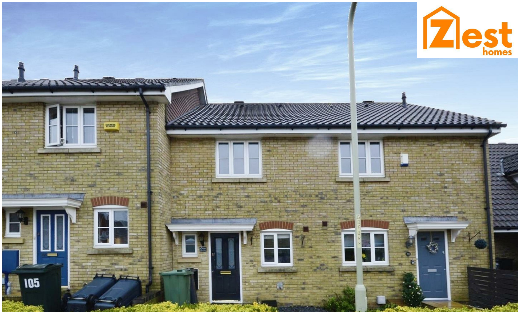
107 Guernsey Way, Ashford, TN24 9LQ £1,200